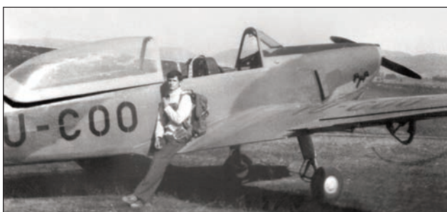
Above: Utva-built Aero-3 JRV 40208 YU-COO, of AK Priština, seen in the early seventies (AK Sarajevo)

YU-COJ Ikarus Aero-2DE (ex 2BE) ? .63 Built .52 as Aero-2BE. JRV 0867. Modified to Aero-2DE, 57. ZSH AK Zagreb, Zagreb, SR Hrvatska, YU-COJ CofR 340, 11.2.63. Regn cld on RV request 6.1.69. and AK Zagreb 18.8.70.