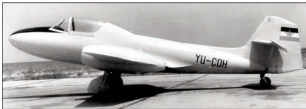
Above: A profile of the Ikarus Š-451M Zolja prototype YU-BHK Left and Below: Two views of the Ikarus Š-451 Zolja experimental jet prototype YU-COH in May 1960 (Artwork and photos by O Petrovic)

This experimental jet Š-451M (factory designation), LŠ-451M or 451M-ŠL (both JRV designations), was designed by Major Dragoljub Bešlin, as a revised development of the previous 451M type, driven by two Turboméca Palas 056A with 130 kp static and 160 kp maximal thrust. This aircraft broke the world speed record in Class C-1c (weights 1,000-1,750 kg) on 19.5.60 at 500.2 km/hr.