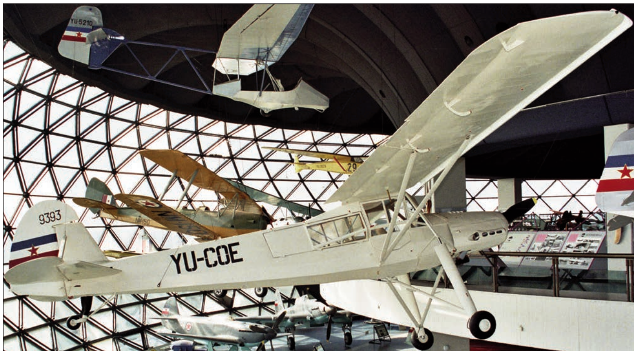
The post-war Yugoslavian Civil Aircraft Register (continued)