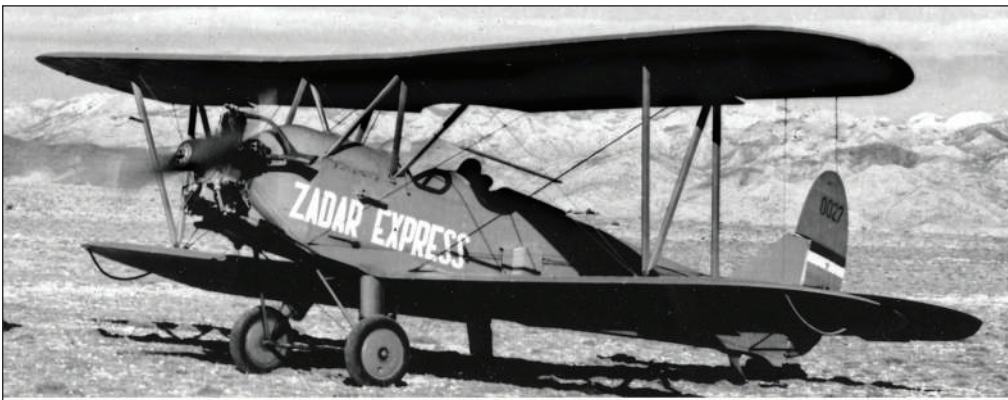
Left: Polikarpov Po-2W s/n 0027 YU-CNI: (Top) wearing the name "Zadar Express" prepared for take-off at Zadar in May 1972. (Bottom) Seen in a rather embarrassing position overturned on its back, date unknown.

There was a reported sighting of YU-CNI under rebuild at Sinj, Croatia in 1999 but it may not be linked to this incident.