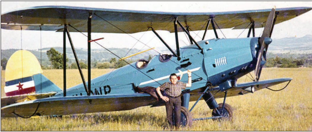
Left: Polikarpov Po-2W ex JRV 0105 YU-CNP used by AK Valjevo was previously light grey overall. Note absence of s/n on the rudder of the later colourful version. (AK Valjevo)