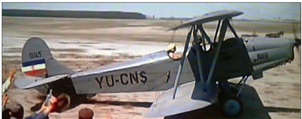
Left: Polikarpov Po-2W ex JRV 0045 YU-CNS featured in a movie in 1968. It is now in the Salis Collection at La Ferté-Alais, was registered F-AZDB on 26.10.84 and is still current.

YU-CNZ Mráz K-65A Čap (Roda) 94 .61 Built .46. Ex JRV 9396. SVC Vršac, Vršac, SR Srbija, YU-CNZ CofR 306, .61. Regn cld on JRV request 3.9.63.