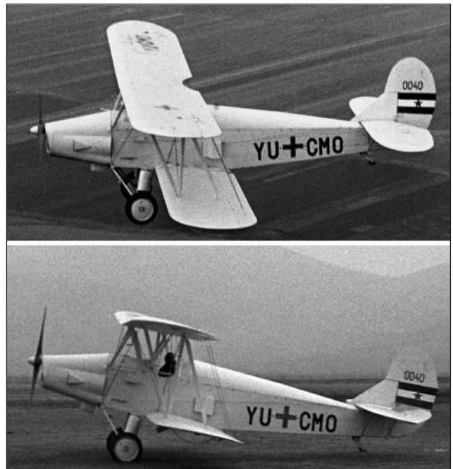
Below: Polikarpov (Utva-mod) Po-2W ambulance version c/n 10772 s/n 0040 YU-CMO, VSJ, SVC, Vršac, SR Serbia, 1960 (Artwork by O. Petrović)

YU-CMO Polikarpov Po-2 / Utva Po-2W 10722 .56 Built .45. Ex JRV 0040. VSJ, SVC Vršac, Vršac, SR Srbija (Serbia). YU-CMO CofR 260, .56. Ambulance version, Utva mod to Po-2W, .58. Regn cld on JRV request 8.12.67.