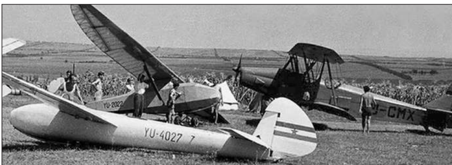
Left: Polikarpov Po-2W YU-CMX (in the background) and two gliders, a Koser-Hrovat KB-1 Triglav YU-4027 and Grunau Baby III YU-2022, at Kumanovo sport airfield, SR Macedonia, in the late fifties