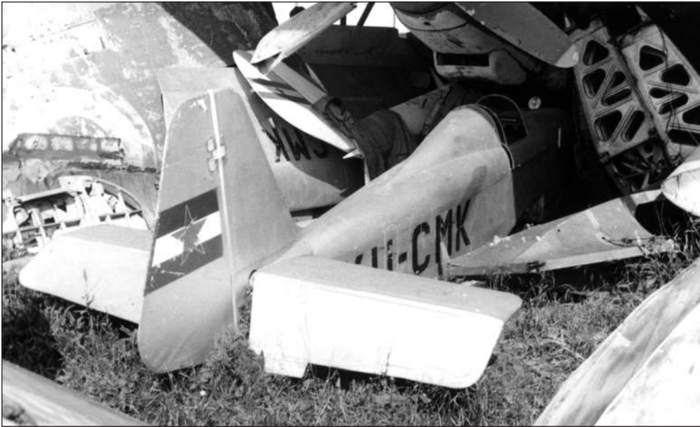
Left: ARZ Cvjetkovic CA-51 YU-CMK is the second example of the type to have become part of the Belgrade Aviation Museum. It was to be found in the external store in May 1972 with many other aircraft pending the construction of the modern museum building. ( Ian Burnett)

YU-CMK ARZ Cvjetkovic CA-51 F5 .55 Built .55. ZSH Central Board, Zagreb, SR Hrvatska (Croatia). YU-CMK CofR 244, .55. Regn cld on VSJ request 24.11.69. To Aviation Museum, Belgrade, stored.