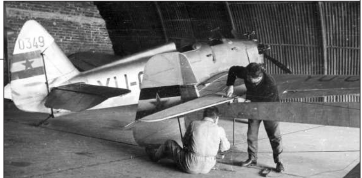
Right: Yakovlev UT-2 YU-CJU in the hangar of the Aero Club at Titograd. Note the tail of Čavka (Jackdaw) glider being worked on in the foreground

YU-CJV Polikarpov Po-2 10930 .55 Built .45. Ex JRV 0059. VSCG, AK Nikšić, Nikšić, SR Montenegro. YU-CJV CofR 180, .55. Regn cld on JRV request 12.2.57.