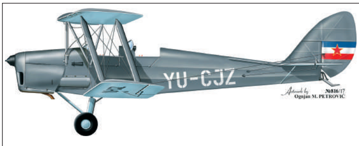
Above: de Havilland DH.82A Tiger Moth YU-CJZ of the AK Travnik, late fifties

All YU-CGx to CJx series are thought to have been cancelled by 1986 unless otherwise quoted.