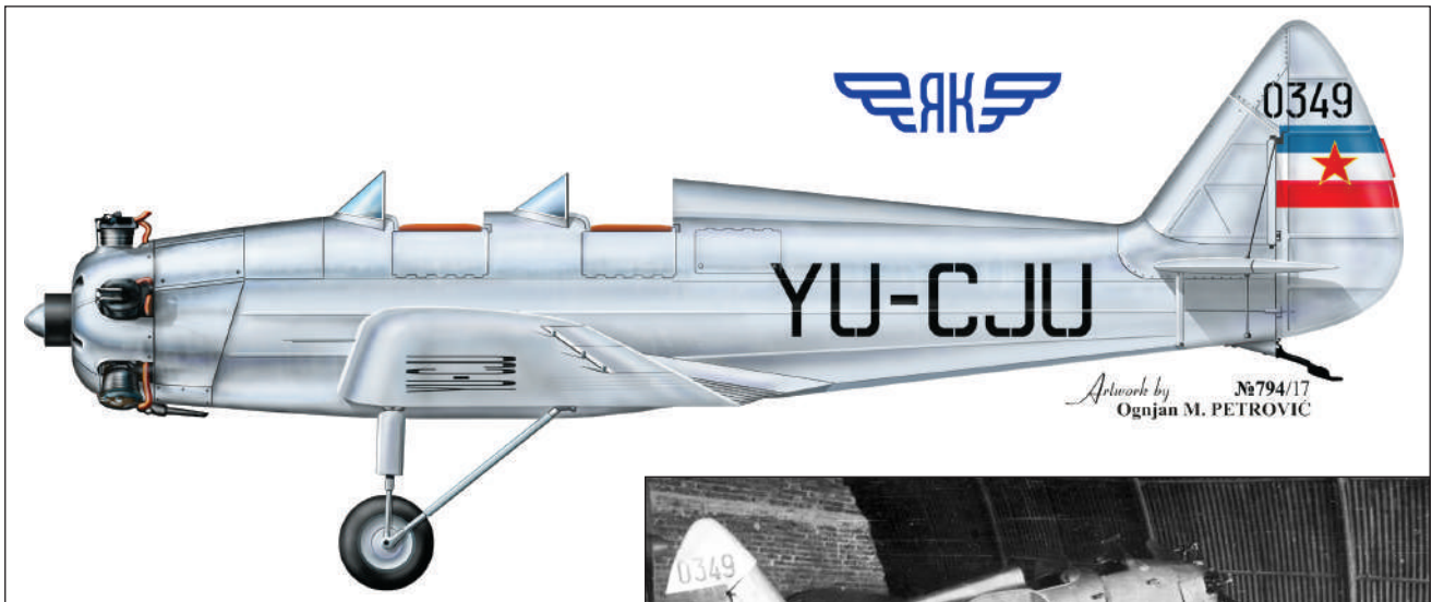
Above: Yakovlev UT-2 0349 YU-CJU, AK Titograd, 1955.