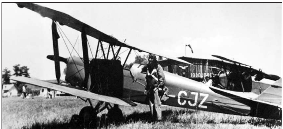
Right: Tiger Moth YU-CJZ owned by AK Travnik seen on a visit to Sarajevo.