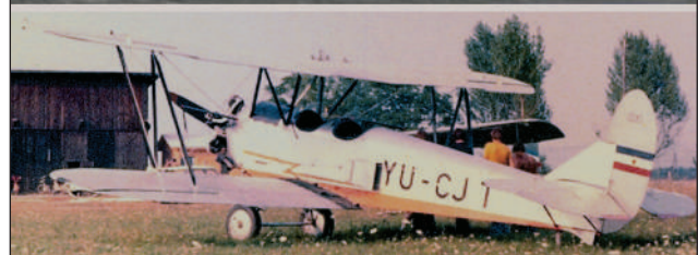
YU-CJT CofR 178, .55. Utva mod to Po-2W, .58. ZLOS DLC Novo Mesto, SR Slovenia, ca .60. Damaged 50% 29.11.60, repaired. Regn cld on Aviation Museum request 1.10.86. To Aviation Museum 3.87. Sold to USA as N9016J, CofA issued 22.1.09 to V A Samuilov, Sound Beach, NY ; still currently regd as such. [However, believed sold to VH-?, and/or w/o .89.]

YU-CJU Yakovlev UT-2 03741 .55 Built .47. Ex JRV 0349. VSCG AK Titograd, Titograd, SR Montenegro. YU-CJU CofR 179, .55. Regn cld.