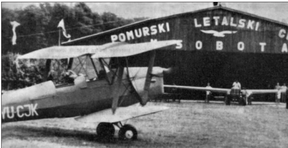
Above: de Havilland DH.82A Tiger Moth YU-CJK, AK Ljubljana, late fifties