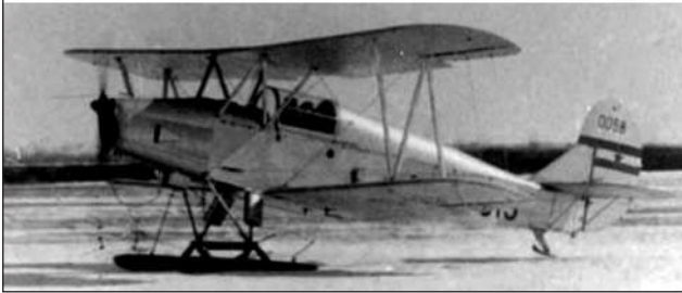
Above: Ambulance Polokarpov Po-2W SS YU-CIJ equipped with ski u/c, showing the cover of the stretcher bay open ready to receive the casualty. In the lower photograph there appears to be two crew on board. (AK Novi Sad)

YU-CIP Utva 251 Trojka 0752 .55 Built .49. Ex YU-CBN(1) .50, ex JRV 0752. VSM AK Skopje, Skopje, SR Macedonia. YU-CIP CofR 149, .55. In service 1955-58.