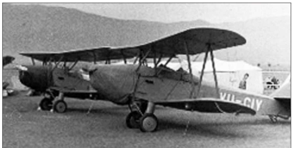
Right: Polikarpov Po-2W YU-CIY parked with another example in the airfield near Livno, SR Bosnia & Herzegovina, in the very early sixties. (AK Sarajevo)