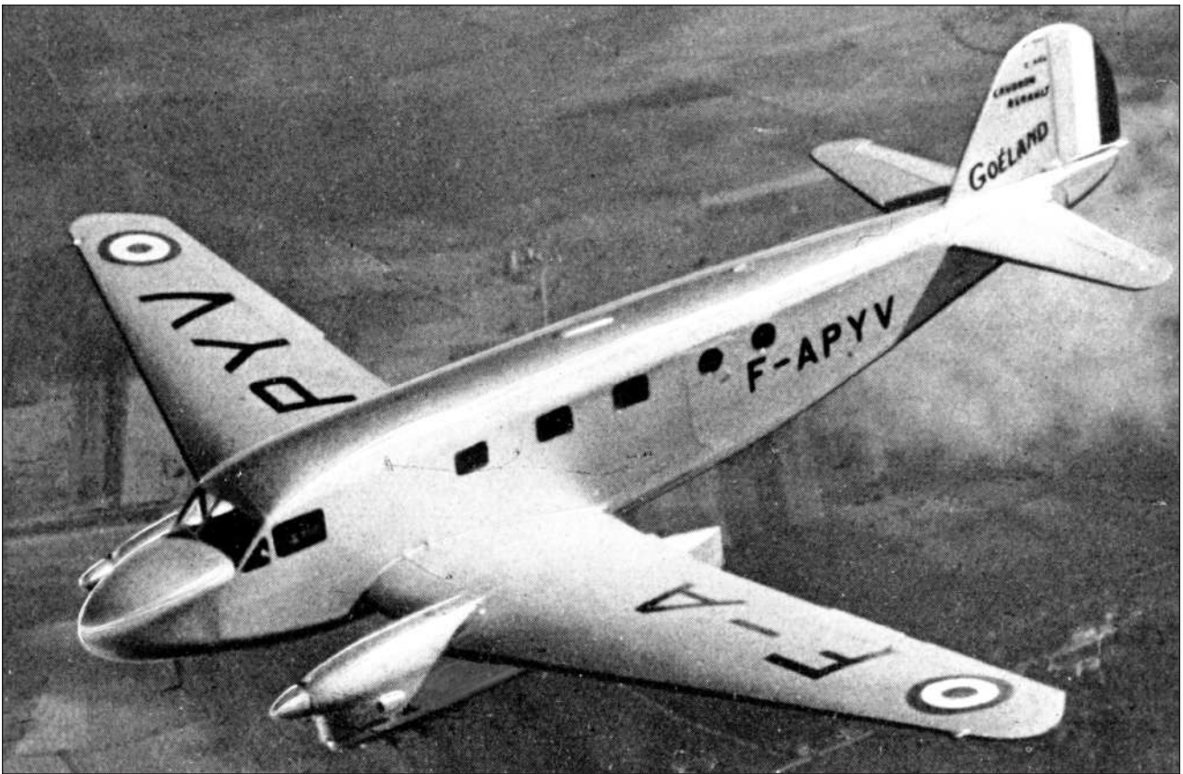
Above: Caudron Goeland F-APYV illustrated in a mixture of civil marks and military roundels.

5453 F-APZF Leopoldoff L.3 Colibri 16 Etat Français - Aviation Populaire (15.11.37)