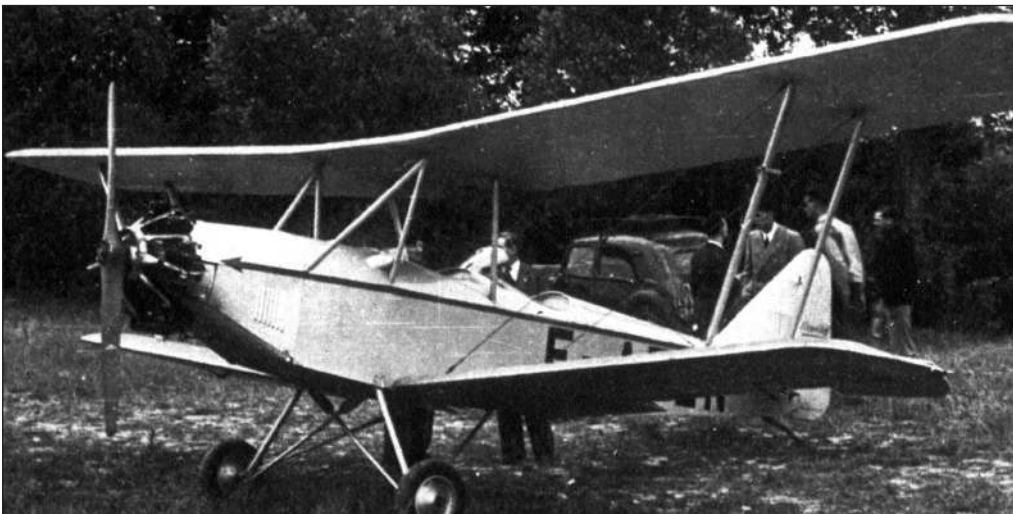
Left: The Leopoldoff L.3 Colibri was another type produced for the Aviation Populaire movement, along with the Potez Sauterelle, Salmson Cricri, Caudron Luciole and Mauboussin Corsaire. This example, F-APZN, was particularly long-lived and is still currently registered.