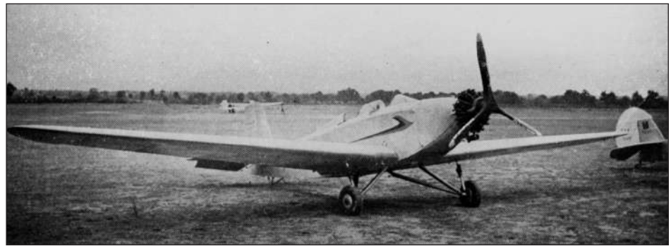
Right: The Mauboussin 123 Corsaire was built by Fouga who acquired the company in 1936. Some 60 were built for the Aviation Populaire powered by a 60hp Salmson 9Adr, here fitted with a 3-blade Régy propeller.