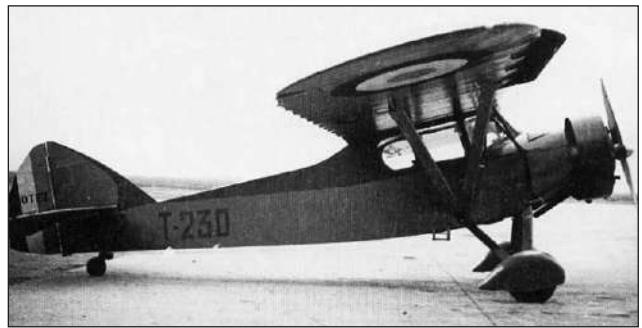
Above: A Potez 585 wearing French Air Force serial T-230. This was possibly one of the batch listed below, originally given civil registrations probably pre-delivery, but unfortunately the c/n on the rudder is obscured. The type was developed from the Potez 36 and 43 series and of the 108 built 99 went to the Air Force for liaison purposes.