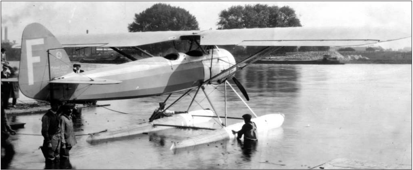
Above: Morane-Saulnier built eight examples of the model 314H two-seat parasol-wing floatplane trainer for the Gnome-Rhône school including F-ALPU, later F-APPU. This one is unmarked.