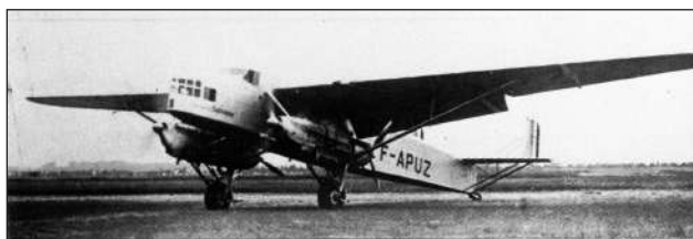
Above: Farman 2231 F-APUZ seen at Buenos Aires in November 1937 after the record transatlantic flight. The forward pair of engines are running. Below: F-APUZ in close-up shows the massive size of this record-breaking aircraft.

5081 F-APUX Hanriot 161 12 Ex Fr mil T.311 Etat Français (22.3.37); loan Aéro Club de Metz, Metz 5113 F-APUY Hanriot 161 10 Ex Fr mil T.309 Etat Français (31.3.37); loan Aéro Club du Mâconnais, Mâcon 5456 F-APUZ Farman 2231 01 Etat Français (20.11.37); named " Chef Pilote L Guerrero ". Took part in Marseilles-Damascus-Paris Race 20.8.37 but delayed by weather. Broke World 1,000 km record with 10 tonnes load 10.37. Made record flight Paris - Santiago, Chile 11.37, pilot Paul Codos..Delivered to French Navy but destroyed in service 9.11.39. unkn F-APVA Potez 585 96 unkn F-APVB Potez 585 97 unkn F-APVC Potez 585 98 unkn F-APVD Potez 585 99 unkn F-APVE Potez 585 100