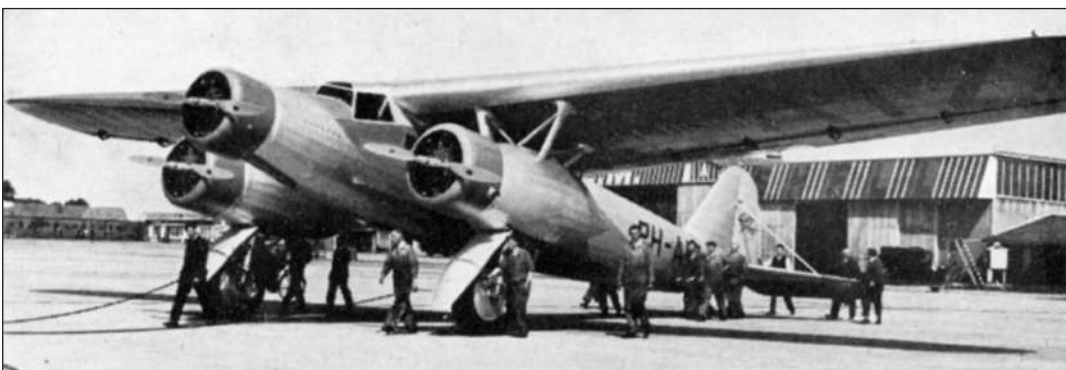
Left: Fokker F.XX PH-AIZ was the sole example of the type and served with KLM from 1933 to 1936. It was sold to Alfred Pilain, ostensibly for the non-existent company "Air Tropicque" but delivered to SFTA as F-APEZ for the Spanish Republicans, later becoming EC-45-E.