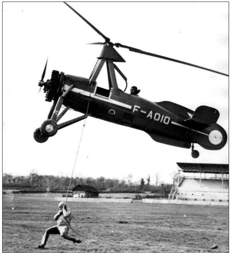
Cierva C.30A F-AOIO, the former G-ACWI, was involved in an interesting demonstration of the potential use of an autogyro for the delivery of medical supplies and doctors in a confined space. The demonstration was organised by the Director of the French parachute school at Flers in February 1938 and was intended as an alternative to parachuting to avoid injury to the doctor. Above: the medical supplies are dropped. Then, top right, the 'doctor' feeds out a knotted rope and, bottom right, lowers himself from the cockpit to the ground. Was this really less likely to endanger the doctor?

4372 F-AOJC Hanriot 182 4 Cie des Avions Hanriot, Arceuil. (12.9.35) 4377 F-AOJD Hanriot 182 5 Cie des Avions Hanriot, Arceuil. (17.9.35) 4380 F-AOJE Hanriot 182 6 Cie des Avions Hanriot, Arceuil. (20.9.35) 4391 F-AOJF Hanriot 182 7 Cie des Avions Hanriot, Arceuil. (26.9.35) Wfu after accident 3.38. 4406 F-AOJG Hanriot 182 8 Cie des Avions Hanriot, Arceuil. (11.10.35) Type change 6.36 to Hanriot 183 c/n 1. 4407 F-AOJH Hanriot 182 9 Cie des Avions Hanriot, Arceuil. (11.10.35) 4432 F-AOJI Hanriot 182 10 Cie des Avions Hanriot, Arceuil. (25.10.35)