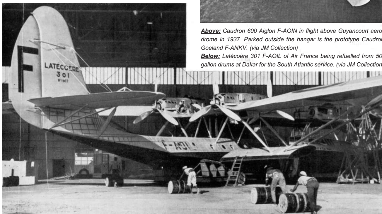
Below: Latécoère 301 F-AOIL of Air France being refuelled from 50-gallon drums at Dakar for the South Atlantic service.

4552 F-AOIQ Morane 341/3 25/4383 Pierre Reliaud, Sid bel Abbes, Oran, Algeria. (13.1.36)