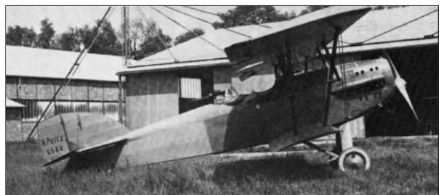
Below: The Potez 25 was a mid-1920s design built in large numbers in France, Poland, Romania and other countries as a multi-purpose fighter/bomber/reconnaissance aircraft. Significant civil conversions were registered in the later 1930s, the example below is claimed to be the prototype Lorraine-powered 25A2 model.