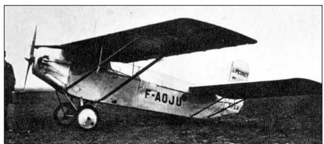
Above: Described as a "double monoplane", the SFCA Taupin F-AOJU was a development of the Peyret VI and was placed first in the 1936 Tour de France for prototypes, powered by a 28hp Poinard B. (via JM Collection)

4777 F-AOKI Caudron 600 Aiglon 133/7244 Georges Parant, Paris. (25.7.36)