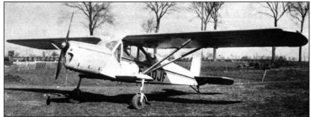
Above: Hanriot 182 F-AOJF was an early production example of the 172, 182 and 192 series. These monoplanes had lower stub wings which were strut and undercarriage mounts and also contained the fuel tanks. The Renault-powered 182 was the main trainer version for civil and reserve flying units.

4797 F-AOKH Caudron 600 Aiglon 136/7243 Aéro Club Gontrand Bonnet, Peronne. (3.8.36)