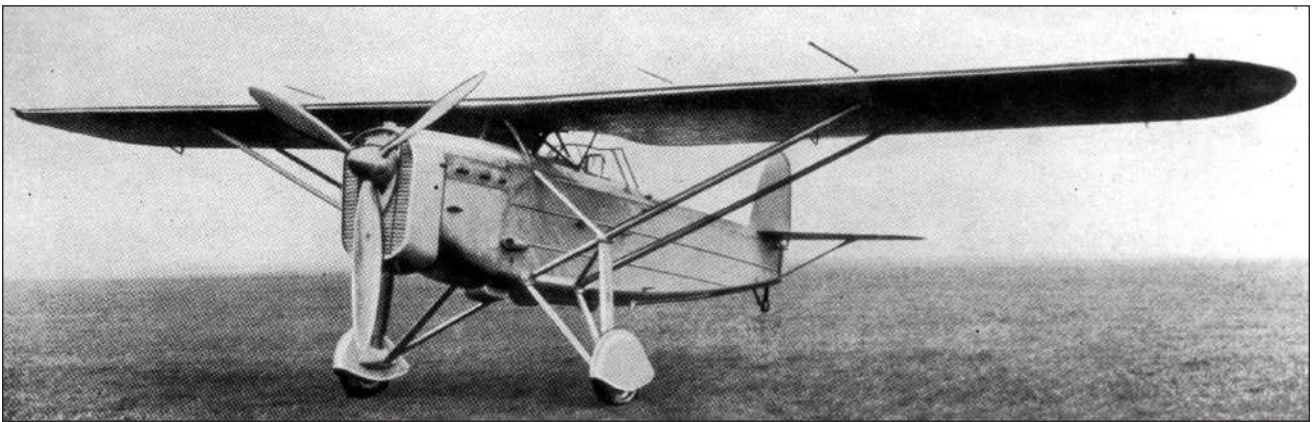
Above: The ANF Mureaux company built over 200 of their parasol wing reconnaissance models of which the 115R-2 was a major development, powered by a 850-hp Hispano-Suiza 12Yers. The design, of which F-AOIS was an example, was the first to use the 3-blade Ratier propeller and the company was later merged into SNCAN.

4508 F-AOJQ Potez 25 29 Cie Française d'Aviation, Boulogne-sur-Seine. (10.12.35)