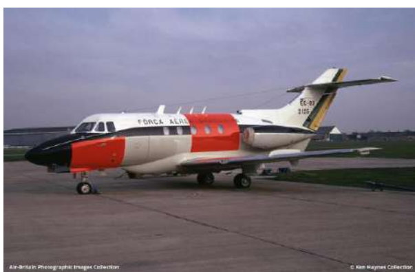
HS.125 Srs 3B/RA 2125 [25164] for the Brazilian Air Force at Hatfield in April 1970.

Hopefully these lovely shots will encourage you all to delve into your collections. We would love to see more de Havilland Moths (of all species!) and Miles aircraft, especially those on foreign registers.