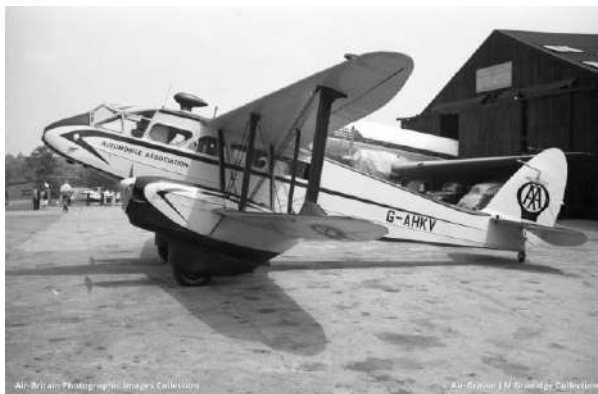
The Automobile Association's DH.89A Dragon Rapid G-AHKV at Elstree on 14th June 1958. It was cancelled as Permanently Withdrawn From Use on 9th September 1969.