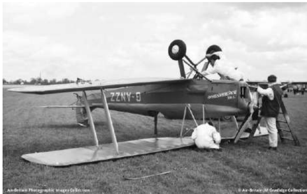
Tiger Moth G-ANZZ at Kidlington on 26th April 1959. Despite this mishap, the Tiger is still active today.