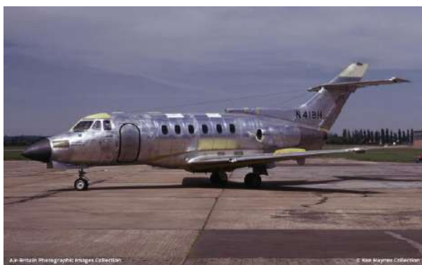
HS.125 Srs 600A N41BH [256040] at Hatfield on 30th May 1974, two days after its first flight.