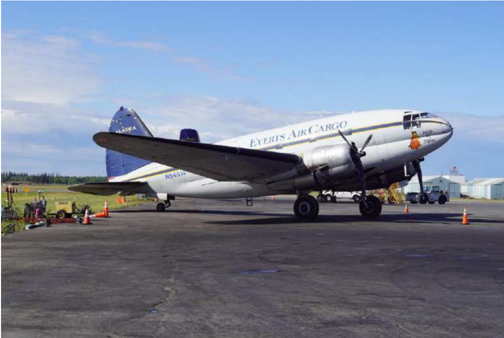
Everts Air Cargo Curtiss C-46A N54514 "Maid In Japan" on the ramp at Fairbanks on June 27th 2018 (Malcolm Fillmore)

40 floatplanes and for the final day the group attended the 50 th Arlington Fly-In.